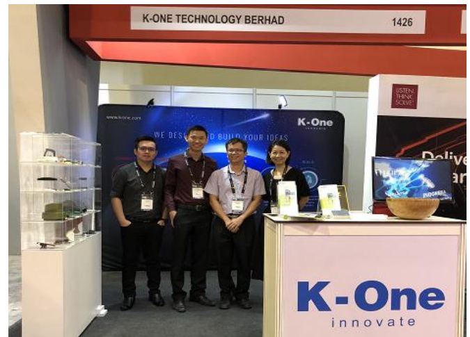
K-One staff standing in attention and getting ready for visitors.

The three-day event featured three themed pavilions, five global pavilions, inspiring keynote presentations and a host of technology forums to address key issues in the electronics manufacturing supply chain. Other event highlights included business-matching sessions, technical forums, workshops and seminars.