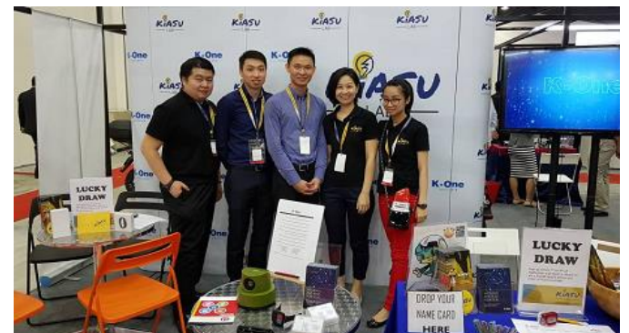
Supporting team representing K-One and KiasuLab