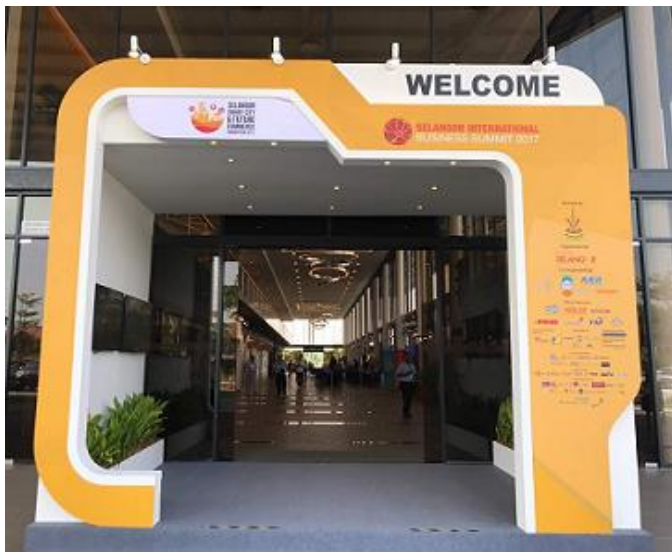
Grand entrance to the exhibition hall

The Selangor Smart City & Future Commerce Convention 2017 held on 7-9 September 2017 at the Setia City Convention Centre, Shah Alam is a 6-in-1 digital and future commerce event which places equal emphasis on smart city solutions, as well as on the various facets of digital commerce, such as Fintech, Smart Commerce, Smart Logistics, Cryptocurrencies and Blockchain technology, among others.