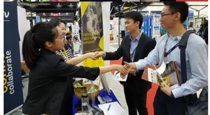
Visitors from various industries paying a visit to our booth