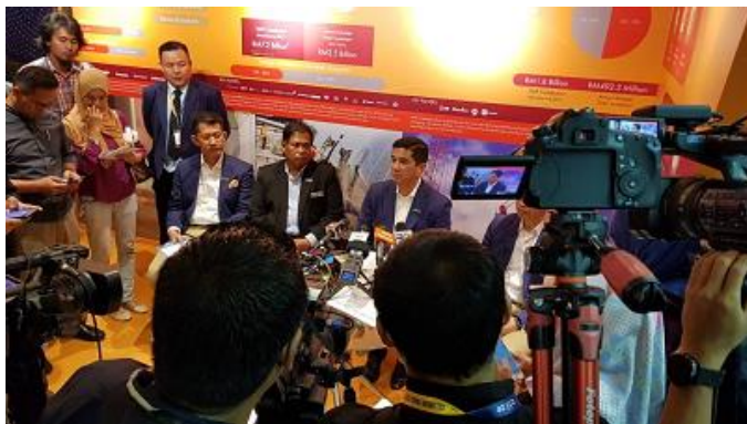
Press conference at Invest Selangor's pavilion

Technology giants such as Google, Nvidia, Alibaba and Tencent took part in the Future Commerce Forum to discuss digital issues and online marketing. Another highlight of the event was the 48-hour smart city hackathons which claimed to be one of South East Asia's biggest hackathons ever.