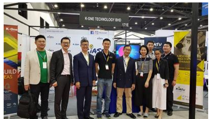
MyloTC's top guns and K-One staffs