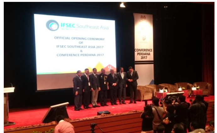
Opening ceremony in Plenary Theatre.

The event was graced by YAB Dato' Seri Ahmad Zahid Hamidi, Deputy Prime Minister of Malaysia and many visitors from near and far which includes neighbouring countries such as Thailand, Indonesia, Singapore, Vietnam, China, India, etc.