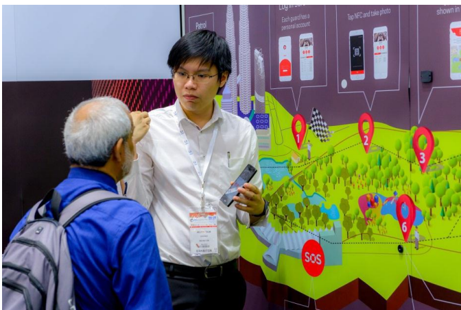
Demonstration of BigEye Patrol to potential customers

Do visit the website at www.bigant.com.my for more information of BigEye Patrol.